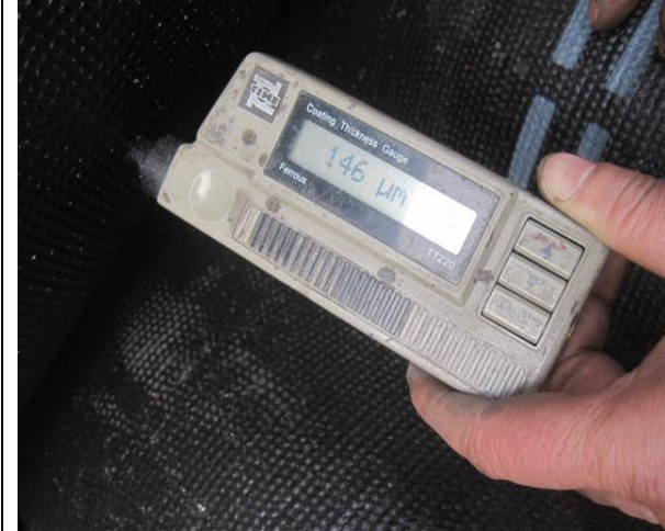
Coating thickness check