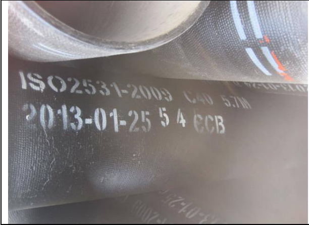
Marking near the socket