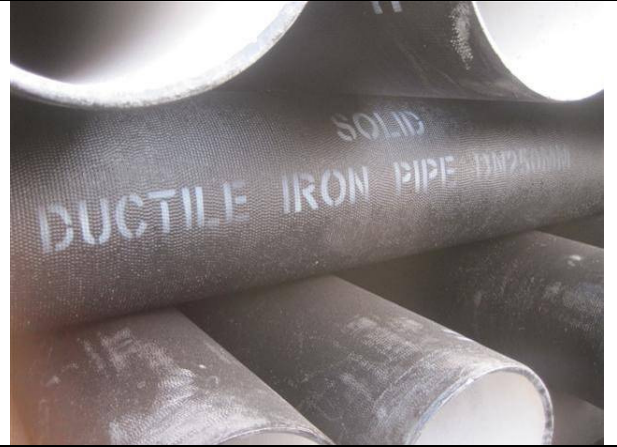
Marking on the pipe body