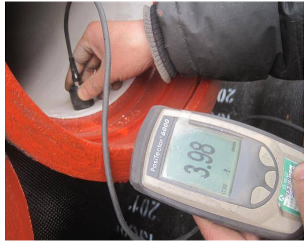
Lining thickness check