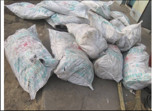
Quantity of rubber ring package check