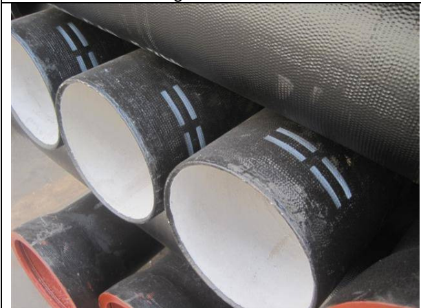
Marking near the spigot