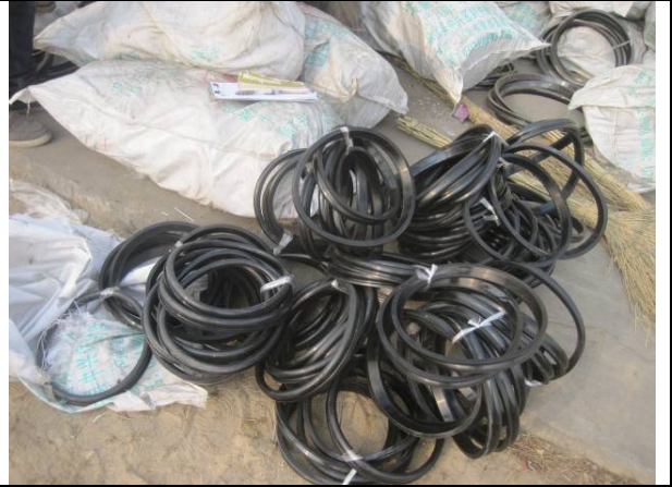
Inner piece check